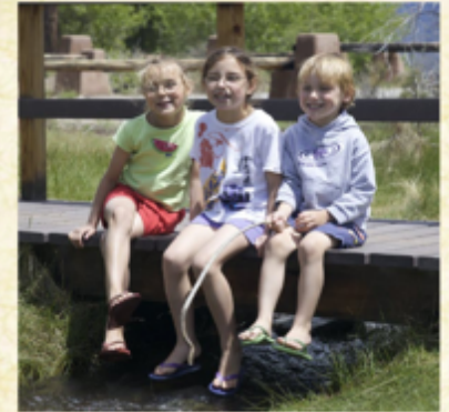
Great Sand Dunes National Park May 2009